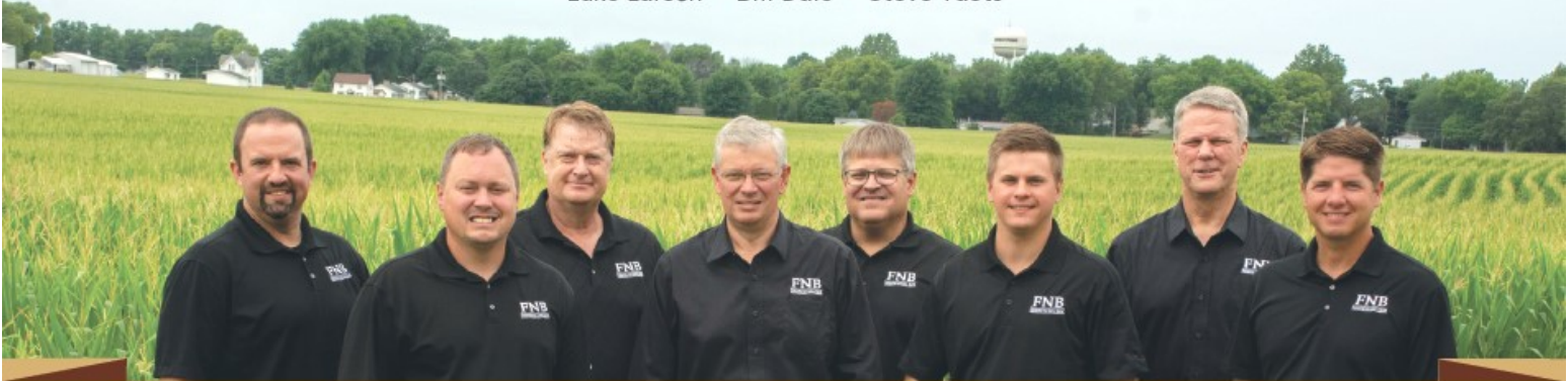
Farmers National Bank Ag Lenders Serving Northwest Illinois Since 1902