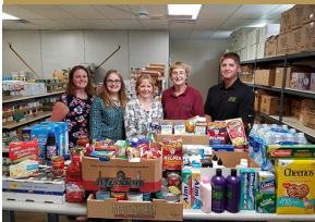
Geneseo Food Pantry